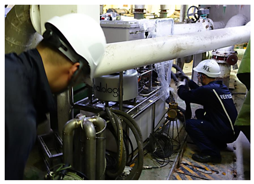
Fig1. Vertechs REALology is deployed in a confined & limited space on the drilling platform.